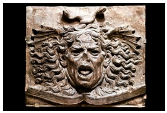
Andrea del Verrocchio's 'Head of a Gorgon' (c. 1480)

Andrew Butterfield Fine Arts and Moretti Fine Art 24 E. 80th St. 212-249-4987 Through Nov. 19